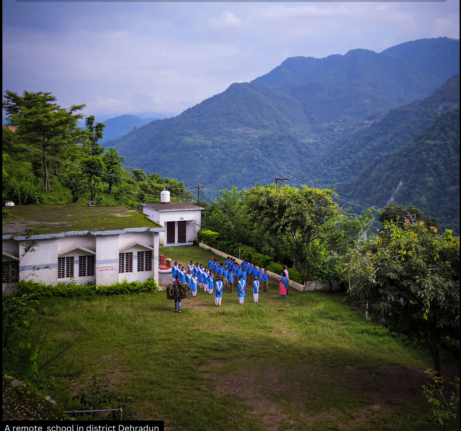
A remote school in district Dehradun