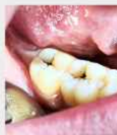
4 6. 4 7