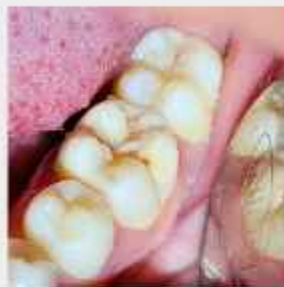
3 6, 3 7