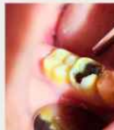
4 6 4 7