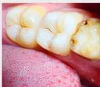
3 6. 3 7