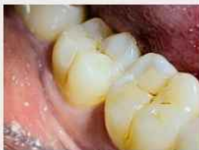
4 6. 4 7