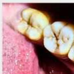
3 6. 3 7