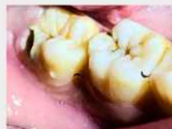
4 6. 4 7