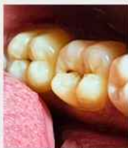
3 6. 3 7