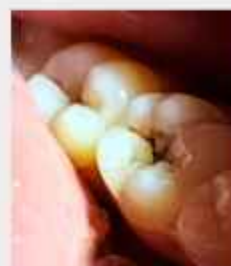
3 6. 3 7